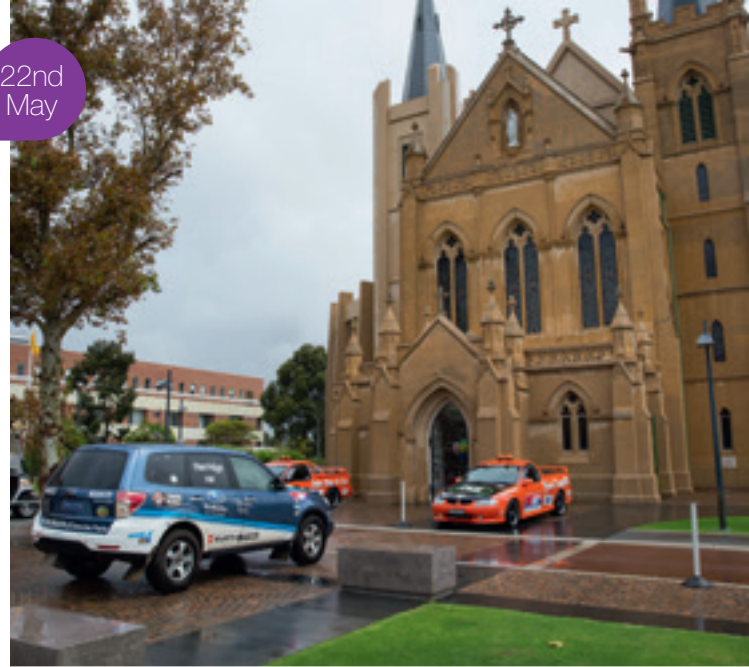
Western Australian cricket player, Justin Langer, addressed a congregation of approximately 450 people for the second annual joint Celebration of Sport.