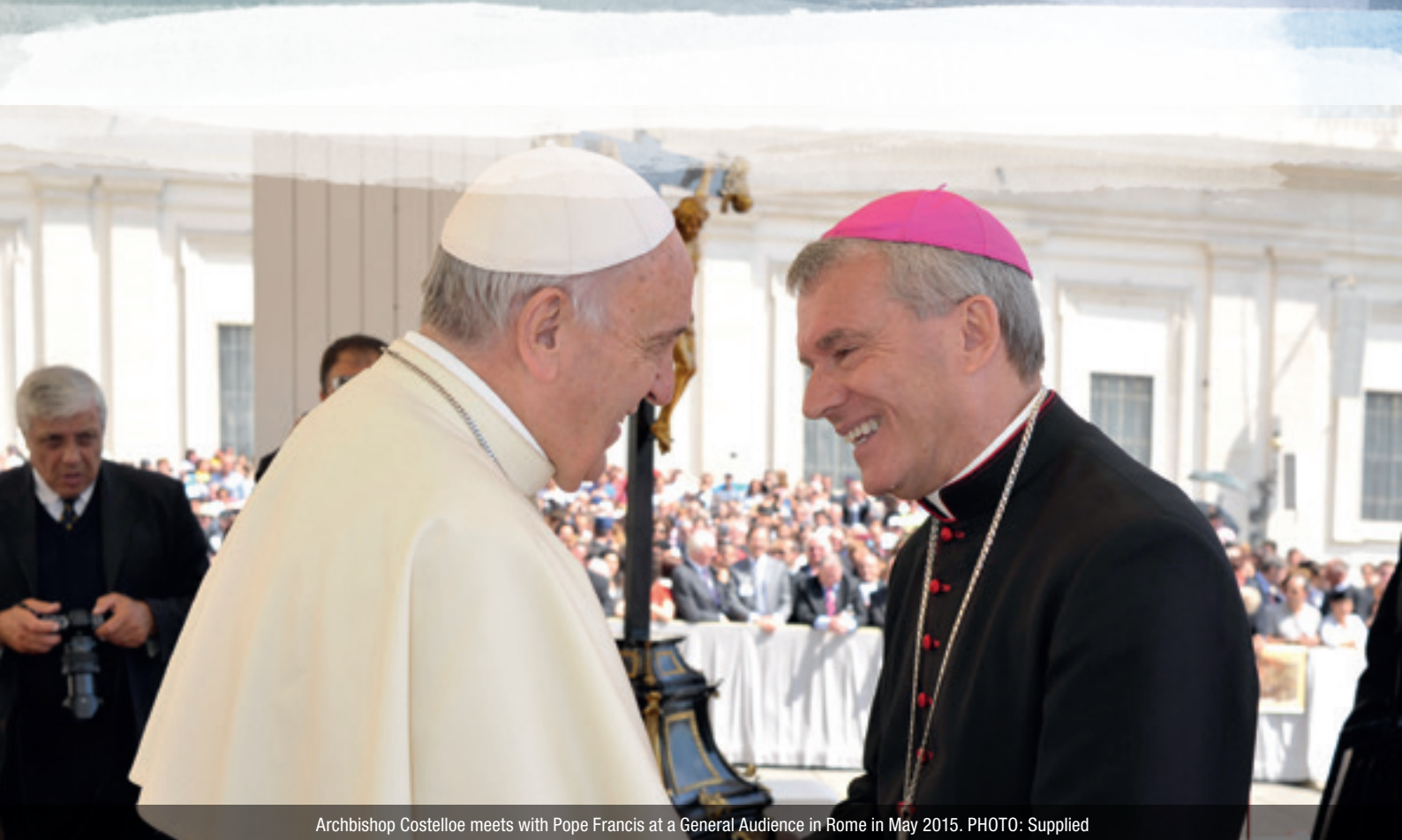
Archbishop Costelloe meets with Pope Francis at a General Audience in Rome in May 2015.